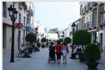
Arcos street is the commercial hub of the city and a pedestrianised area offering a chance for locals to walk and relax

From here we follow the streets San Antonio and Cisne until we reach the Mercado de Abastos (covered market), the bustling commercial hub at the heart of the city. The market is a beautiful regional example of its kind, full of light and colour, And still in full use. The site, and the pedestrian street Arcos in which it is located, constitute a focal point and meeting place for locals, a short walk from the plaza de Espa a where this tour ends.