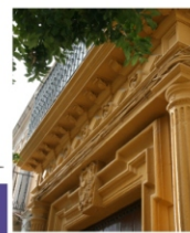
Detail from the fa ade of a stately home on Corredera street