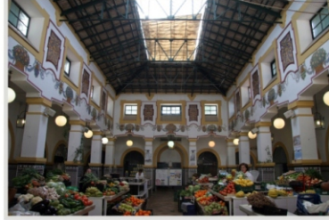
Inside the covered market, 1932

We begin in the plaza de España next to the church of Santa María de Jesús , which formed part of the old convent of the Padres Terceros, today no longer standing. We continue along Corredera street with its beautiful examples of 17 th and 18 th century stately architecture , which further along give way to a domestic architecture whose roots can be found in the rural agricultural past of of the city. There a host of buildings, now disused, testifying to this rich agricultural heritage, such as the almazara (oil press) which stands on the corner of Chamorro street.