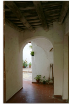
Typical courtyard of a Lebrijan house

famous of the Cruces de Mayo (May Crosses), including the celebrated " Cruz del Rinc n ".